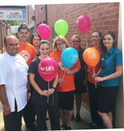
UFS Pharmacies staff getting ready for the 'Celebrating Who We Are Concert' – a great family friendly day in the Hargreaves Street Mall which was held on Saturday 19 March 2016. The festival is an annual event.

UFS Pharmacies supports the Bendigo Festival of Cultures because as a business we share a number of the values that the festival embodies. UFS Pharmacies is a community owned not for profit group that's focused on health and wellbeing outcomes for the community, so we naturally see the festival as a good fit for us.