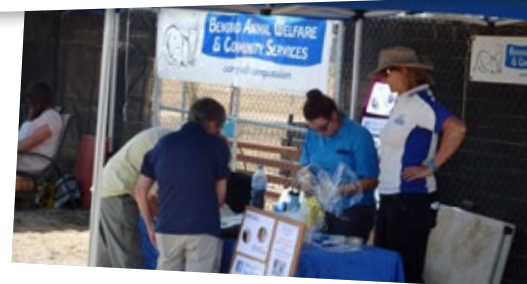
Volunteers at the BAWCS open day.